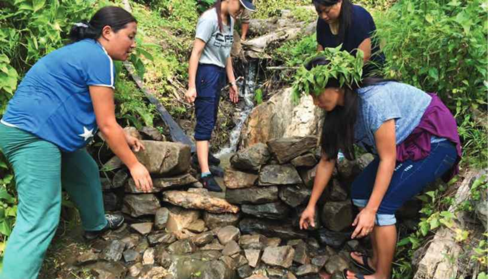
Communities learning construction of check dams using stones at Tsirangtoe, Tsirang

improved fuel-efficient cooking and heating stoves to reduce fuel wood consumption and conserve biodiversity and natural eco-system, and understanding the benefit to alleviate smoke related health problems of the rural population, mainly women and children. The project will be completed in September 2016.