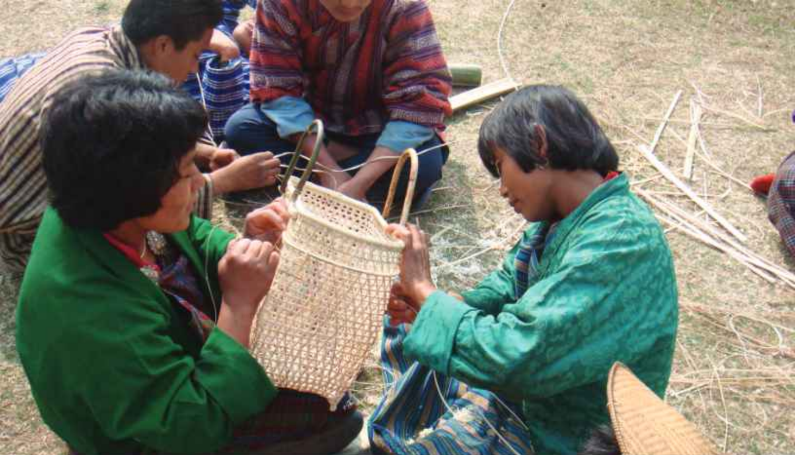
Self Help Group members in Lhuentse weaving cane and bamboo baskets