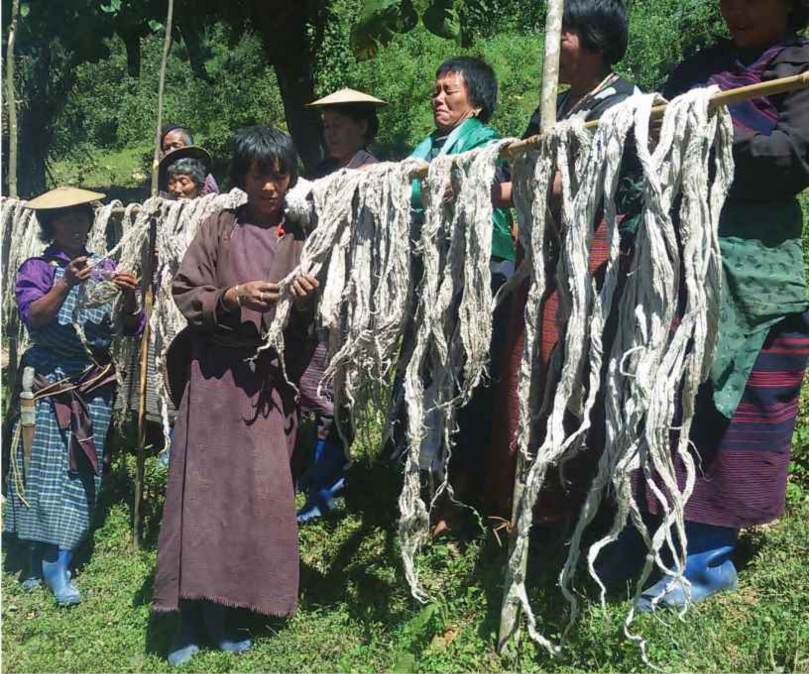
Nettle weaving members process nettle fibre in Khengkhar, Monggar

b. Common Work-shed : In 2015, a total of 15 work sheds were constructed in Wandguephodrang, Samtse, Haa, Monggar, Pemagatshel, Tsirang and Lhuentse for the SHGs members to carry out income generating activities. These work-sheds provide the SHG members a space to work together and exchange skills. It enables them to develop social relations and offers a platform where the group members have an equal say in the decision-making process to promote transparency. The work shed provide a common place for the members to come together work on enhancing their skills and develop social relations. This is also where the exchanges of skills happen and where the group members have an equal say in the decision-making process and offers transparency. The work sheds also serve as multi-purpose halls to organize trainings, conduct meetings and in some sites as sale outlets.