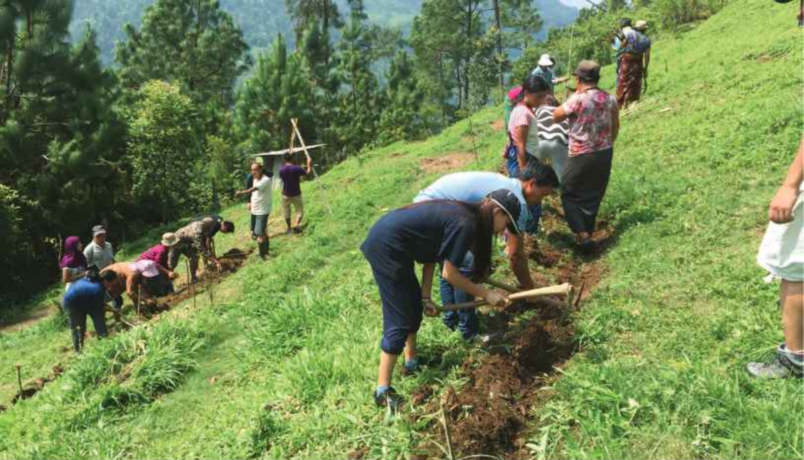
Communities undertaking sustainable land management training in Tsirang