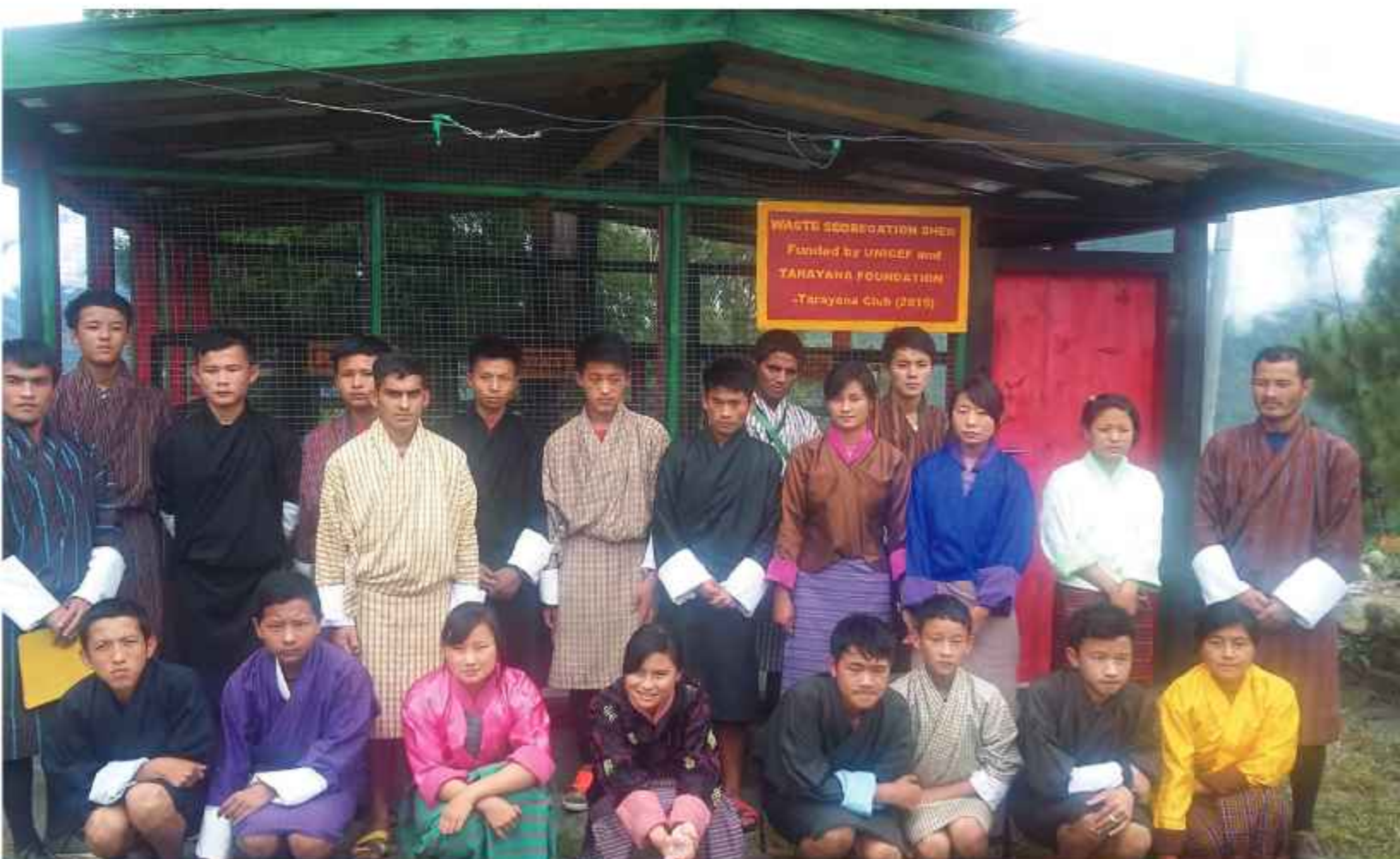
Students from Yadi Higher Secondary group after setting up their community waste segregation unit.