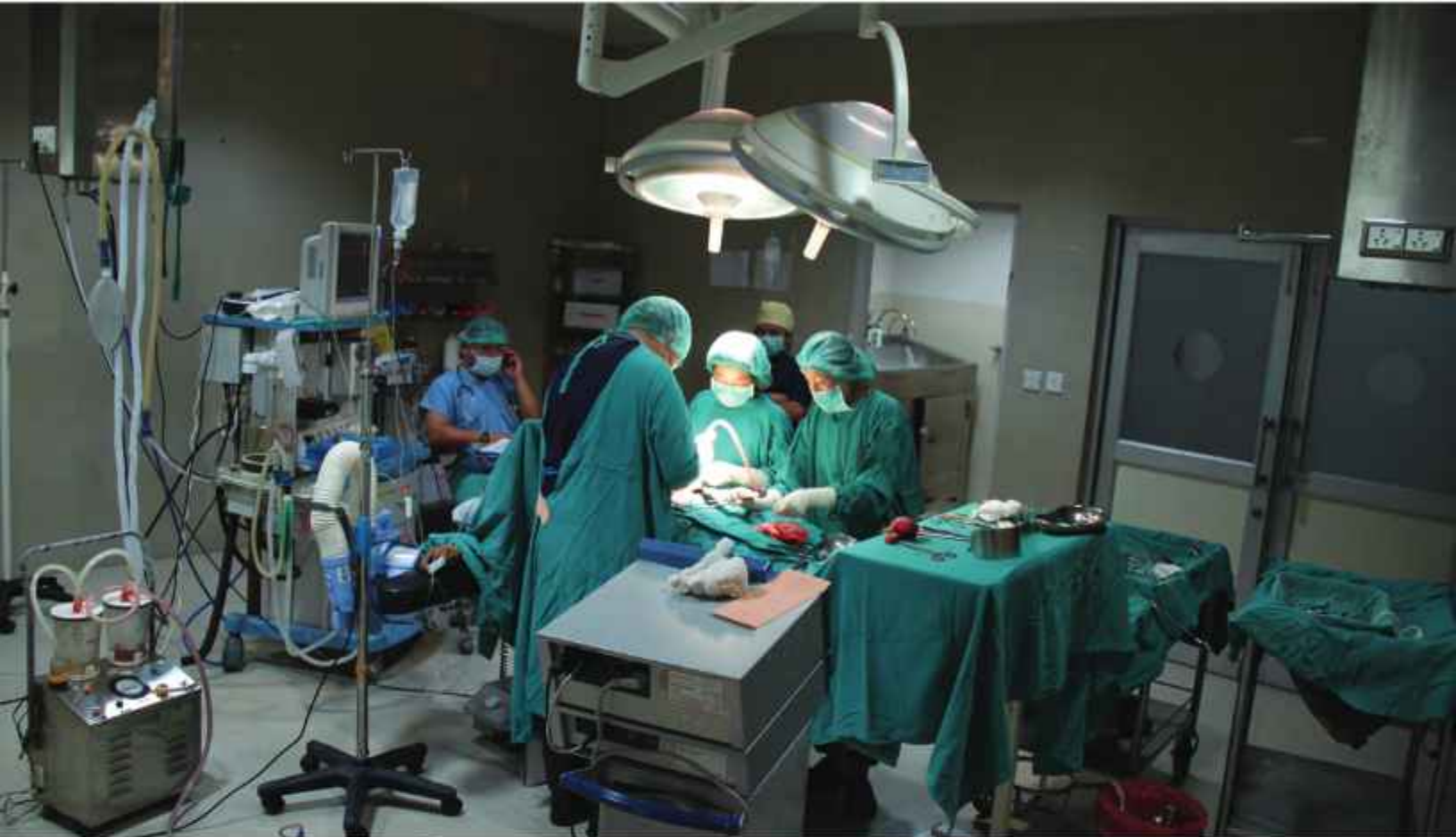
Doctors from Smile Asia performing a corrective surgery in Monggar Regional Hospital