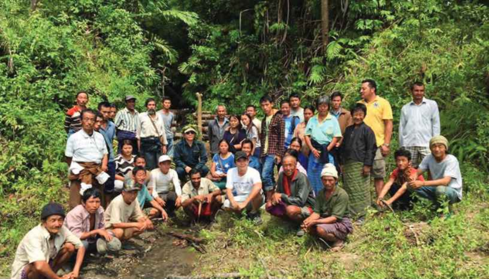
Participants during a soil and land management training in Tsirangtoe, Tsirang