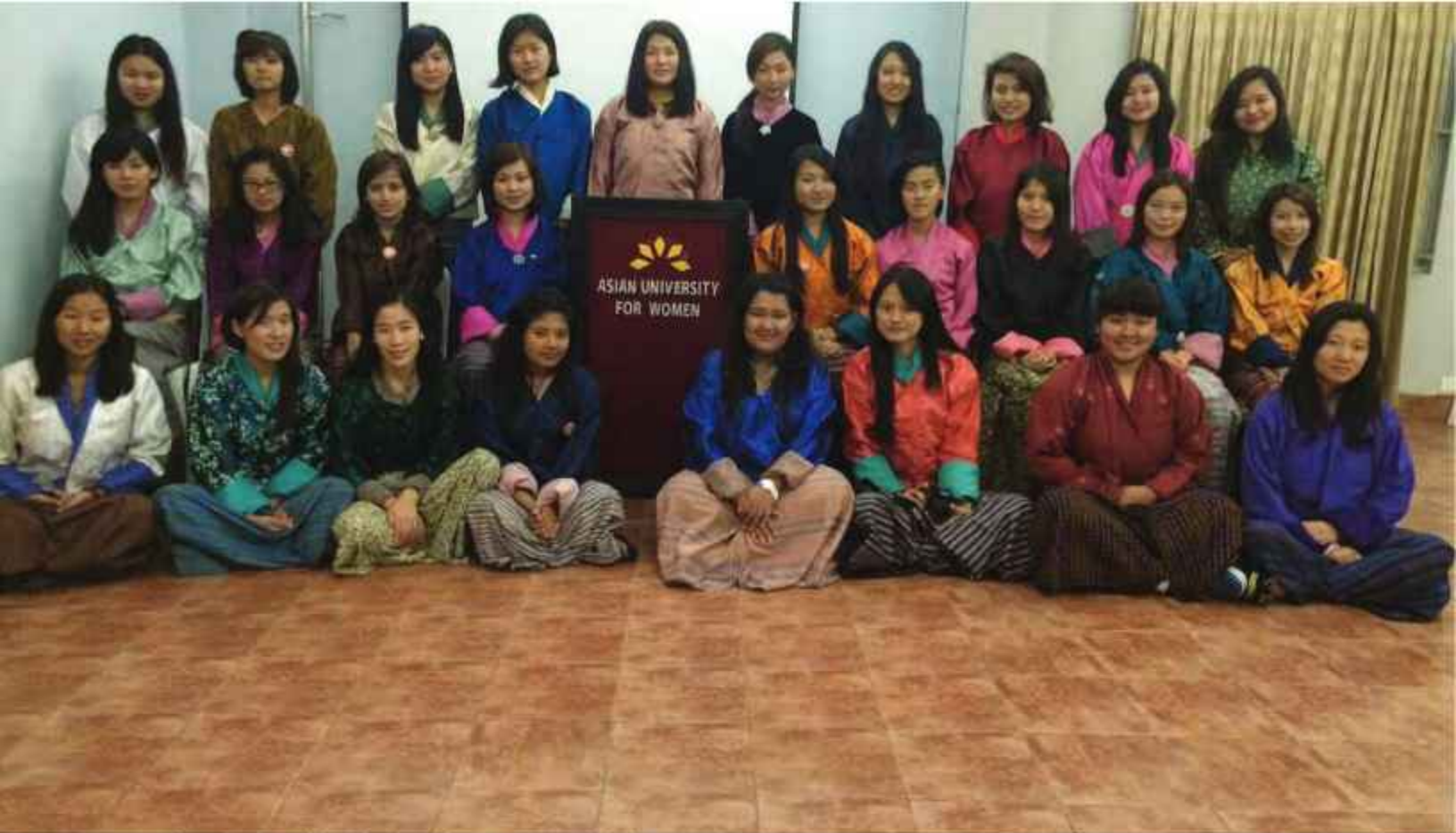
Asian University for Women scholarship beneficiaries in Bangladesh