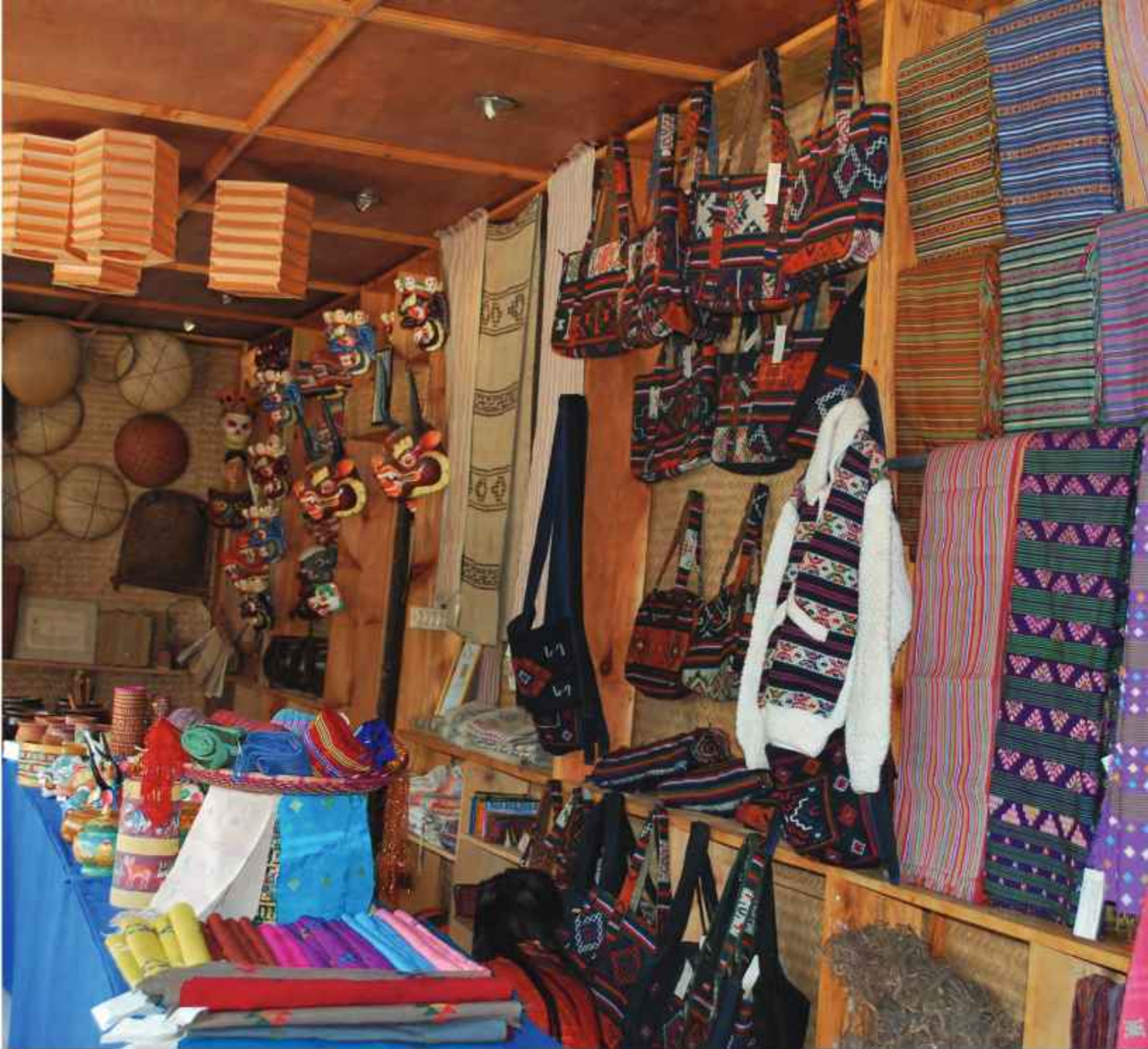
Tarayana Rural Crafts Outlet in Chubachu, Thimphu