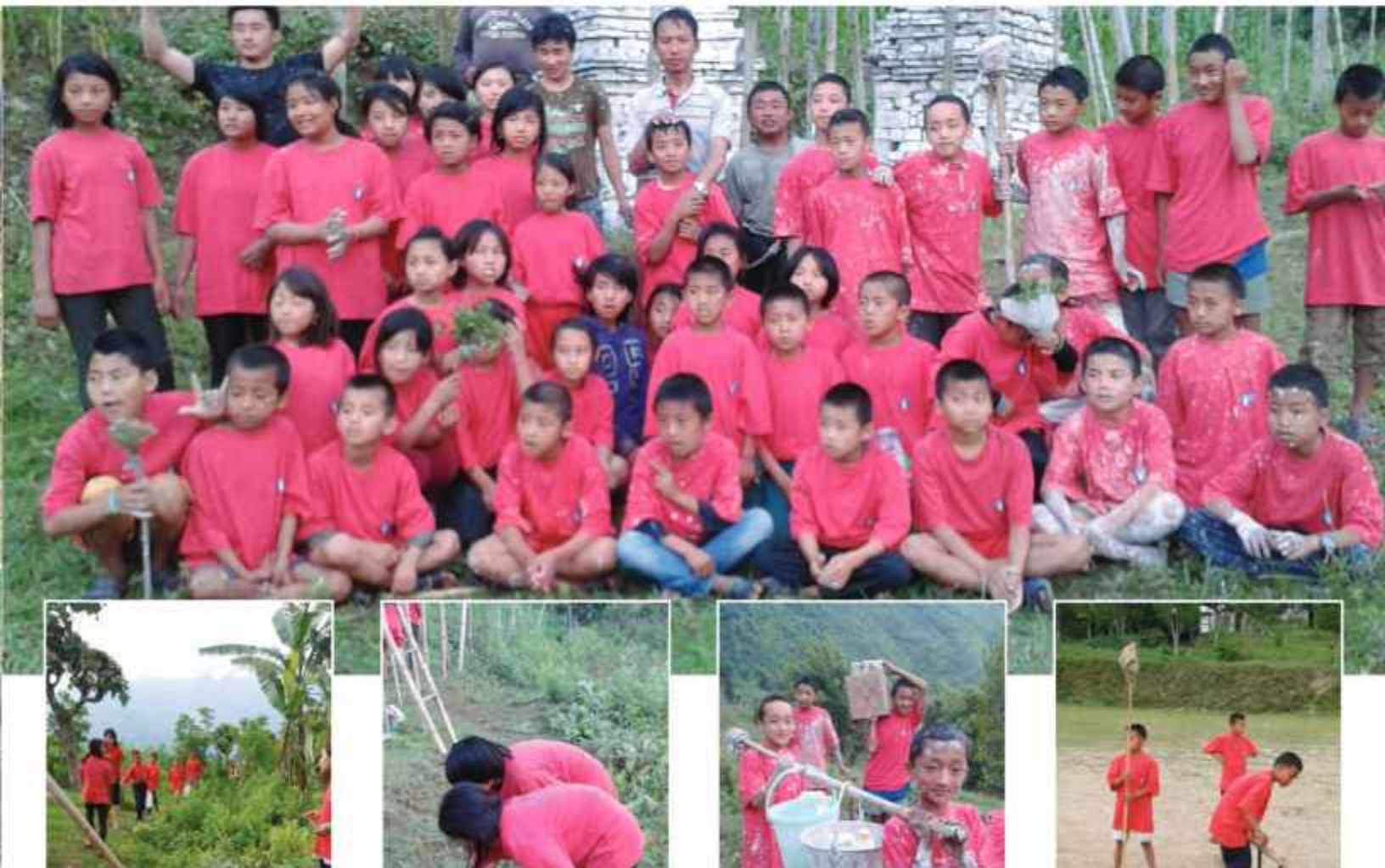
Tarayana School Club members from Chhimong, Pemagatshel undertaking club activities in the community