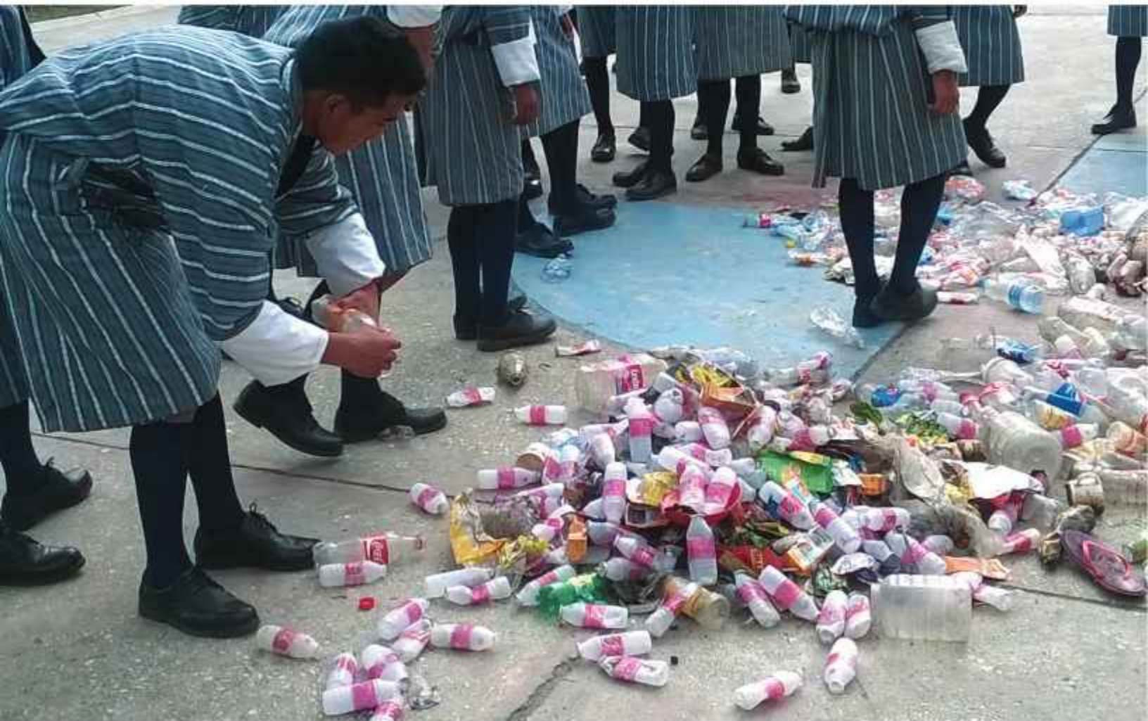
Students from Yadi Higher Secondary group segregating waste

Lhuentse, Thimphu, Trashigang, Samtse, Monggar, and Wangduephodrang. The initiatives include waste management, skills development in pottery, documentation of language and cultural traditions, graffiti art and care giving for those with special needs. Clubs and 6 projects for out of school youth) were implemented by different youth groups in Lhuentse, Thimphu, Trashigang, Samtse, Monggar, and Wangduephodrang. The initiatives include waste management, skills development in pottery, documentation of language and cultural traditions, graffiti art and care giving for those with special needs.