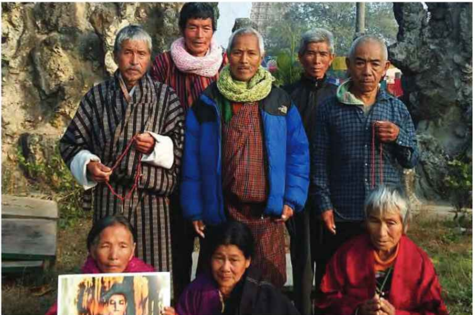
Beneficiaries of Annual Pilgrimage 2015 from Haa and Lhuentse