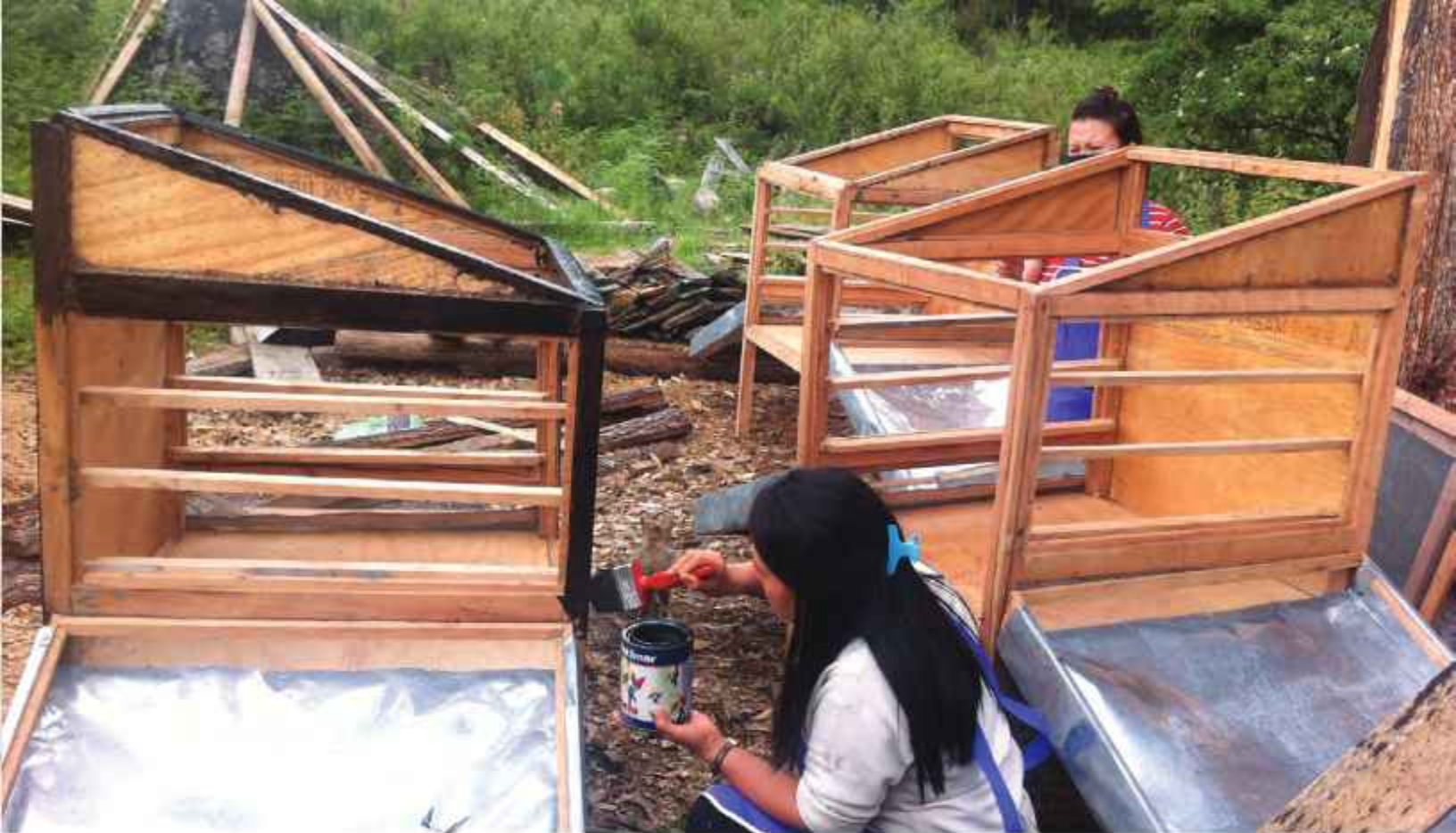
Community members in Tsento, Paro fabricating solar dryers

households and is being implemented on a cost sharing basis with the community members contributing labour. This micro hydro is expected to be complete by June 2016.