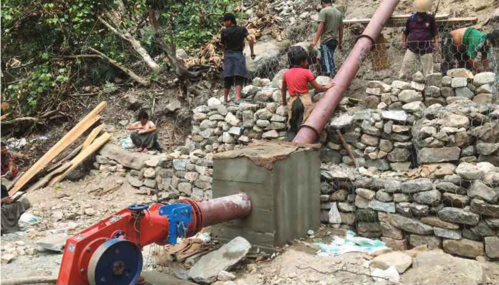
Micro Hydro project site in Dali, Zhemgang