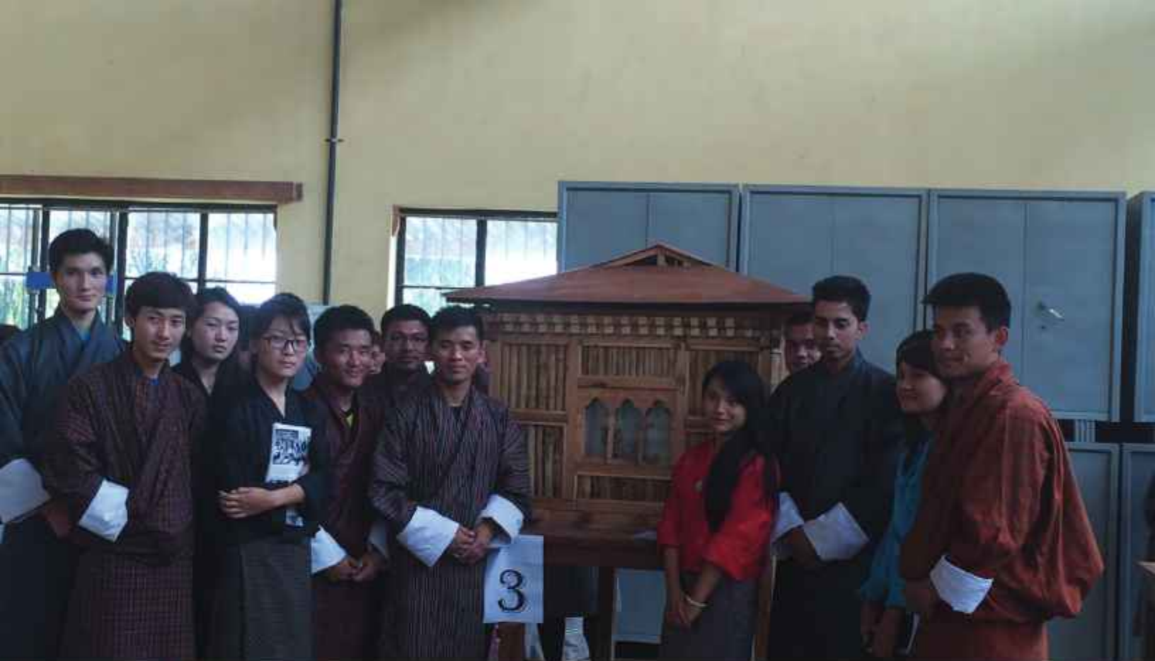
The winning team for 2015 with their model

target Dzongkhags, the Foundation started implementing environmental friendly interventions to manage the watersheds and adopted appropriate water-harvesting techniques in these water stressed target villages. The interventions include community mobilization, trainings on watershed and land management, training on local organic climate change action and learning, clearing of water sources, plantation of suitable plants around the water sources to recharge the water table, installation of rain water harvesting tanks and construction of water reservoir tanks. With 22 water user committees formed to take ownership of the 7 project initiatives in Pemagatshel, Tsirang, Samtse and Monggar Dzongkhags, 2 water reservoir tanks were constructed in the sites and 109 water harvesting tanks were installed by the end of December 2015.