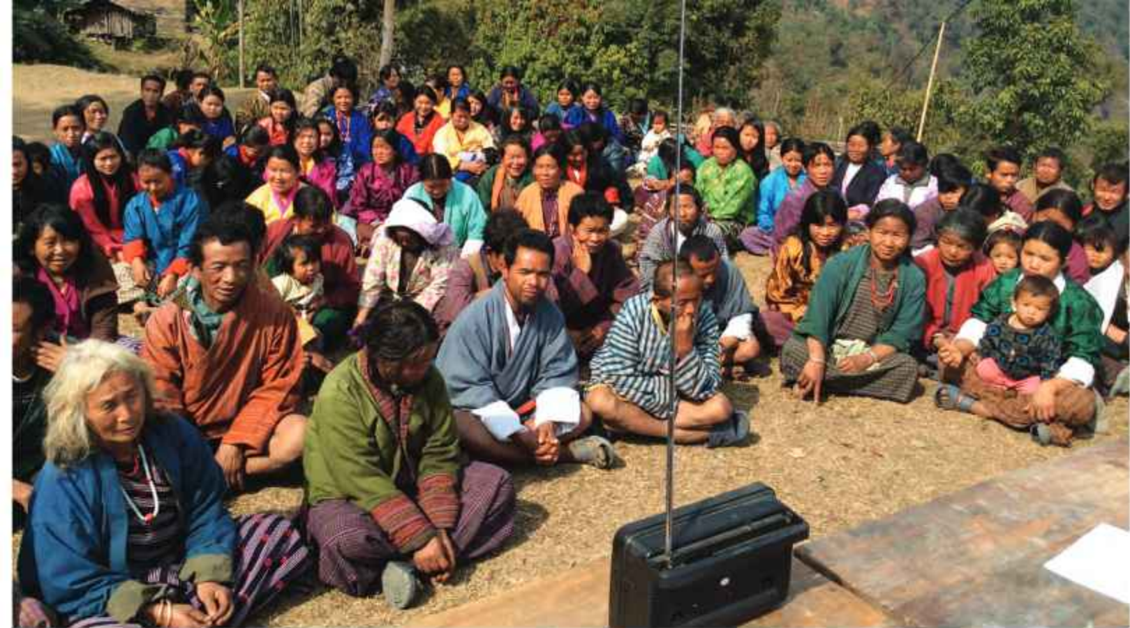
Community members from Samtse Dzongkhag listening to the first trial broadcast in their local language

Ability Bhutan Society, Disabled Person's Association of Bhutan and Bussi-En Social Welfare Corporation, Japan, undertook a joint initiative to better understand the situation of people living with disabilities through a survey conducted in all the Dzongkhags. In the year 2015, Tarayana undertook the surveys in Samtse, Haa, Lhuentse and Bumthang identifying a total of 838 people with different abilities of which hearing impairment was the most common form of disability. Data analysis of the survey for all the twenty districts is currently under process.