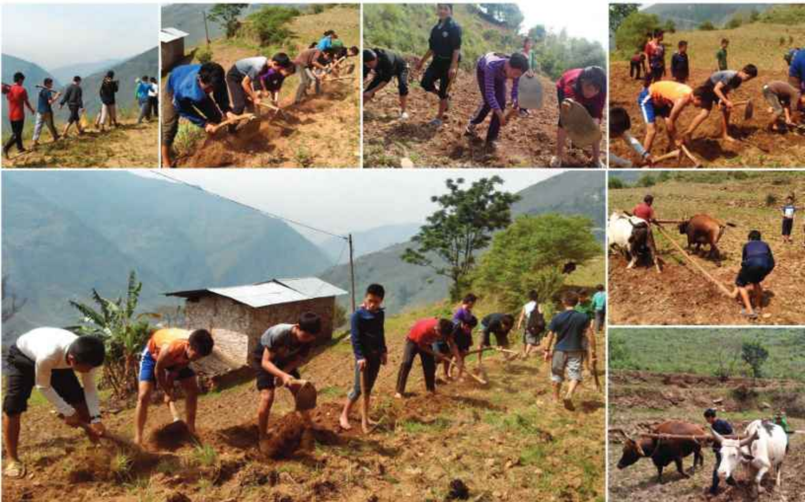
Tarayana School Club members of Kheni Lower Secondary School in Trashiyangtse helping farmers with land preparation